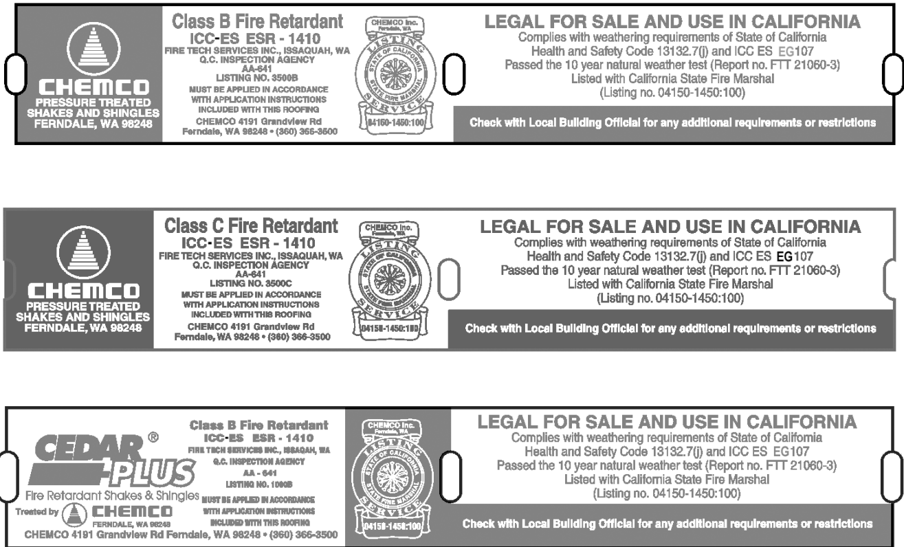
FIGURE 1—PRODUCT TREATMENT LABELS

Starter-course shingles and shakes must be identified with a label bearing the treater's name (Chemco), the product name (Starter-Course), the name of the inspection agency (Fire Tech Services, Inc.), the fire classification, the evaluation report number (ESR-1410) and the words "To be used as starter course only." Labels for "Class B" starter course materials must be printed with orange ink and labels for "Class C" starter course materials must be printed with purple ink. See Figure 2 of this report for starter-course product treatment labels.