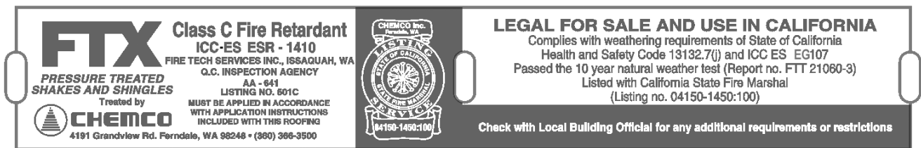
FIGURE 1—PRODUCT TREATMENT LABELS (Continued)