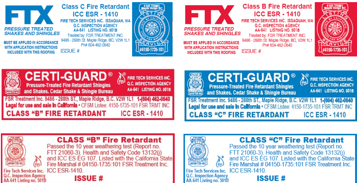
FIGURE 1—PRODUCT TREATMENT LABELS

CHEMCO, INC. POST OFFICE BOX 875 FERNDALE, WASHINGTON 98248 (360) 366-3500 www.chemco.us