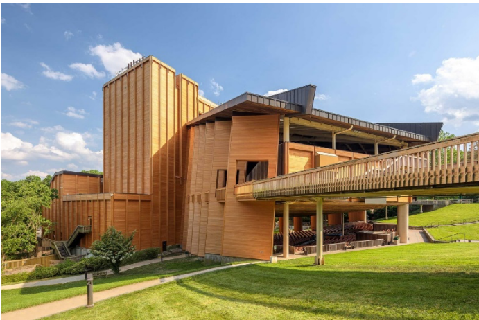
Exterior: SaferWood with Thermex-FR, Douglas Fir, Siding Project: The Filene Center, Wolf Trap, VA (2021), 500,000 BF